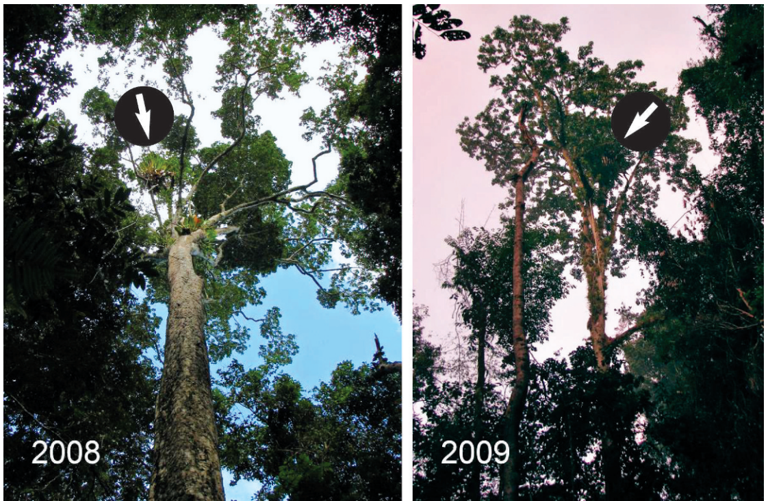
Figure 1. Trees in the Nouragues Reserve (French Guiana) bearing a large Aechmea bromeliad 40–45 m aboveground (indicated by arrow) that served as a nesting platform for a group of Red-throated Caracaras ( Ibycter americanus ) in 2008 and 2009.

thus minimizing disturbance to the birds. When we had remained at the nest site until after dawn, we egressed as quietly as possible. We terminated video recordings in both years when field assistants had reached their maximum allowed stay of 3 mo.