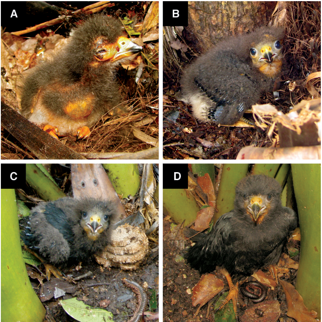
Figure 2. Nestling Red-throated Caracaras ( Ibycter americanus ) residing in Aechmea bromeliads. (A) Nestling 5 d post-hatching on 1 April 2009; (B) The same nestling as in (A) on 18 April 2009; (C) Unknown-age nestling on 21 February 2008 provisioned with a large millipede and remains of a wasp nest; (D) The same nestling as in C on 5 March 2008.

the pattern on adults. Down beneath the mandible was patchy and white. The face and throat were bare, as in adults. The eyes were chestnut brown in color and the skin of the face and throat was yellow, as were the cere and the legs. In 2009, when the nestling was about 22 d old, the skin of the face and throat was becoming gray. The bill was black in contrast to the yellow bill of adult birds. On 1 April 2009, five days post-hatching, the nestling had a large parasitic fly larva inside the right orbit, with the spiracular plate slightly protruding through the lower eyelid